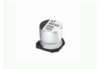
Marking color: Blue